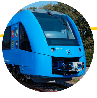
Hydrogen fueling for rail transportation