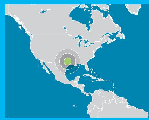
The Louisiana Blue Hydrogen Clean Energy Complex megaproject will produce over 750 million standard cubic feet per day of blue hydrogen and capture over five million metric tons per year of CO<sub>2</sub>.