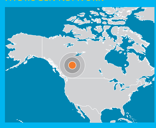
Working together with the Government of Canada and the Province of Alberta, we are delivering a large-scale plan to build a landmark new net-zero hydrogen energy complex, expected onstream in 2024.