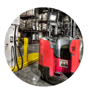
Hydrogen fueling for forklifts & goods transport