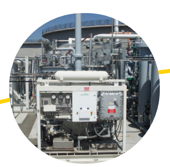
Hydrogen fueling for power generation