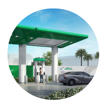
Hydrogen fueling for automobiles

The hydrogen fuel that we supply and distribute is used across the globe and in a diverse range of applications, boosting efficiency and productivity and safeguarding our planet.