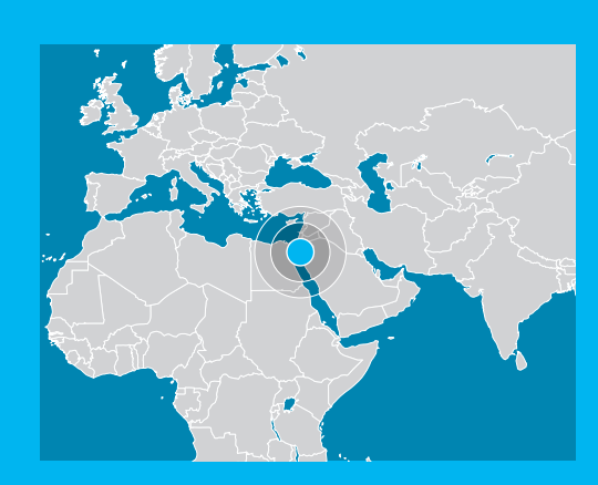
The NEOM green hydrogen project in Saudi Arabia is the world's largest based on proven, world-class technology - and it's a game changer in how the world gets its energy.

This multi-billion dollar project is equally owned by Air Products, ACWA Power and NEOM. It will supply 650 tons per day of carbon-free hydrogen for transportation globally, with Air Products the sole off-taker, and save the world three million tons per year of CO<sub>2</sub>.