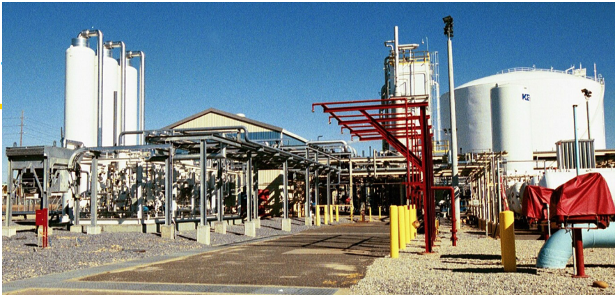
Air Products' peak-shaving LNG plant on Long Island, New York.

Small and peak-shaving LNG plants producing up to 0.5 MTA are being promoted as the way to monetize stranded gas reserves at reduced cost, to replace inefficient aging assets, and to provide fuel for the mining and transportation industries. Air Products helped pioneer the LNG industry, and we have contributed to the success of more LNG operations around the world than any other liquefaction company. Today, we are meeting the need for smaller scale and peak-shaving plants.