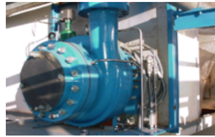
Air Products cryogenic expander typically used in the production of a small LNG plant.